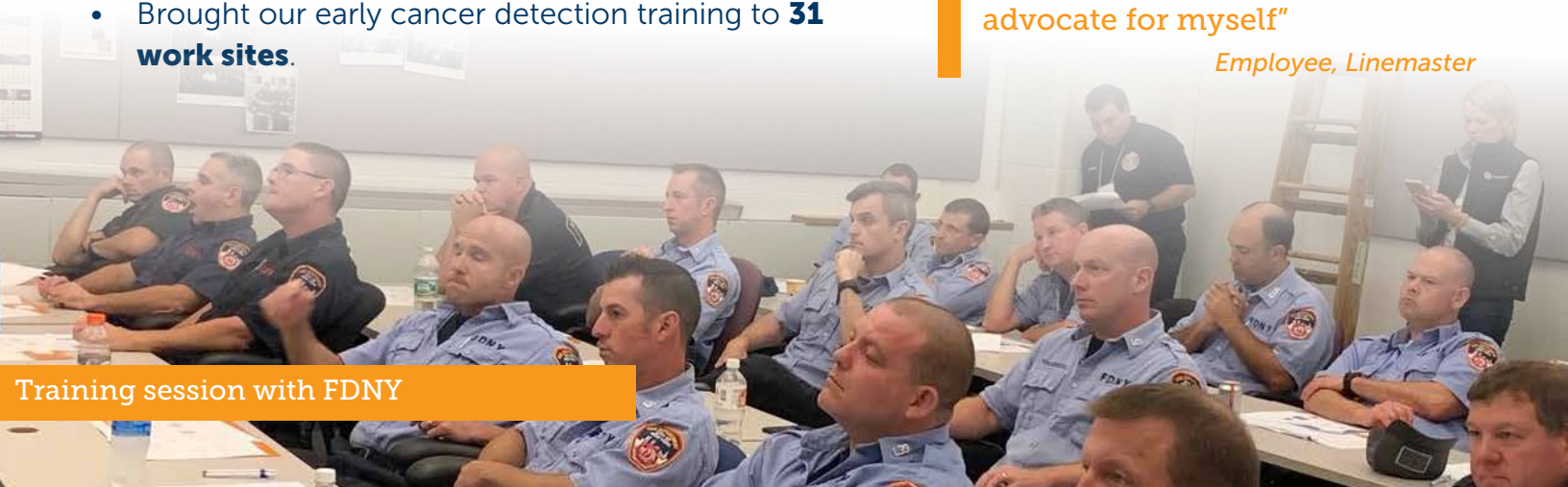
Training session with FDNY